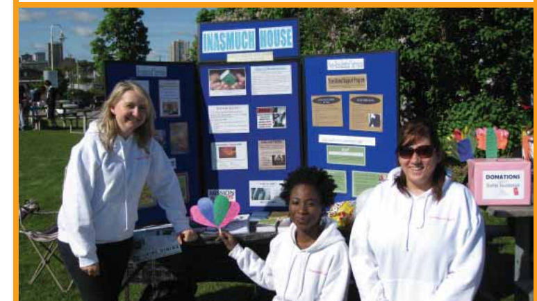
Inasmuch House staff educate the community regarding domestic violence.